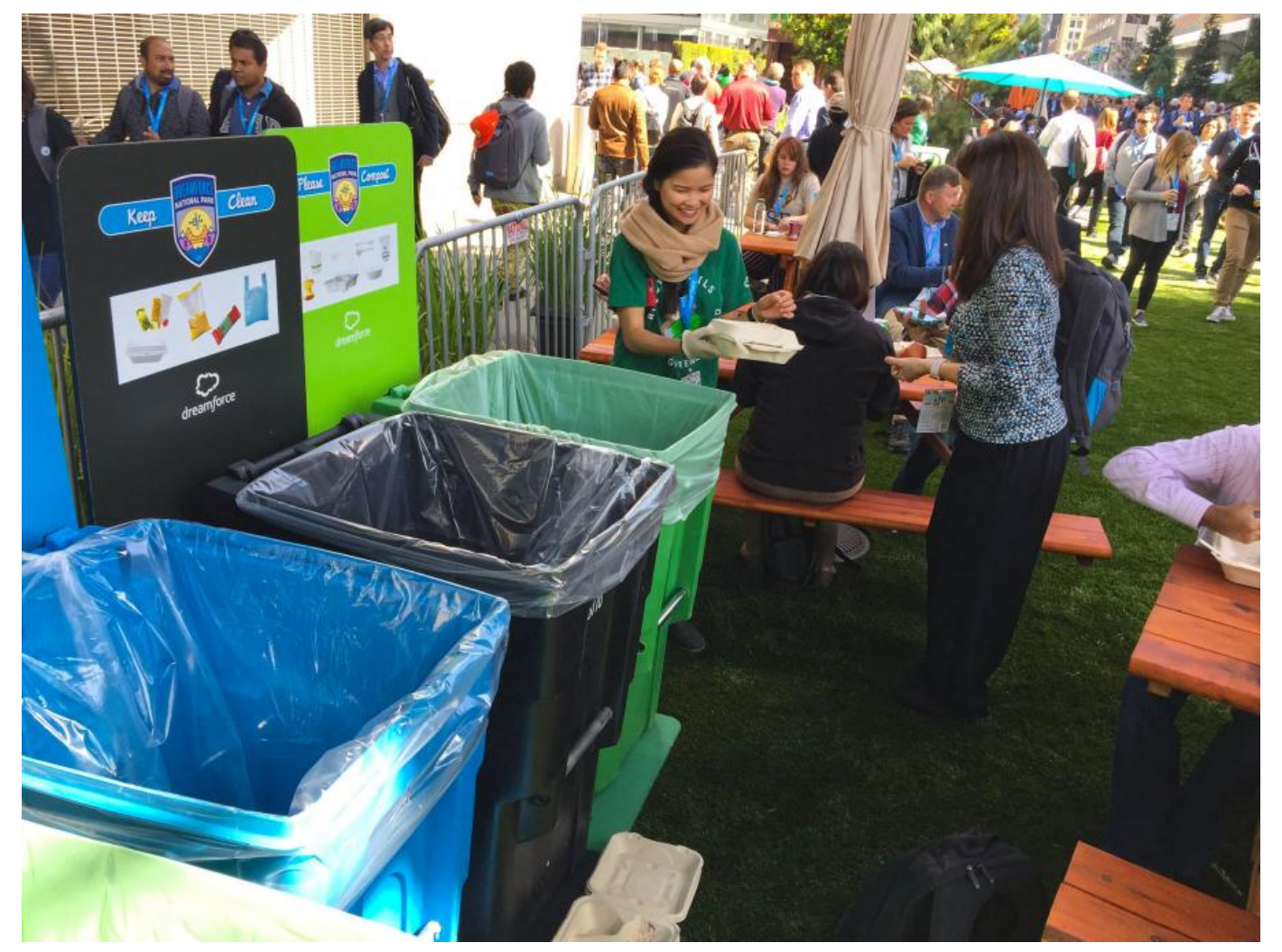
CLEANING & HOUSEKEEPING EXHIBIT HALL TRASH REMOVAL & FLOOR CLEANING HAZARDOUS MATERIALS HAZARDOUS WASTE STICKERS TRASH REMOVAL ANIMALS COMBUSTIBLES